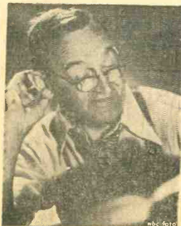
ACADEMY Award winner Barry Fitzgerald assumes the character of Judge Bernard Fitz in "His Honor, the Barber." The judge dispenses justice in his own way on the new NBC program, aired Tuesday evenings.