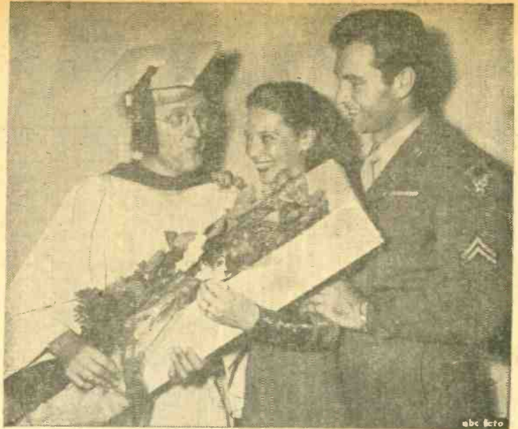
ANNIVERSARY. The O' Professor, Kay Kyser, offers flowers and congratulations to Dinah Shore and George Montgomery on the occasion of their second wedding anniversary.