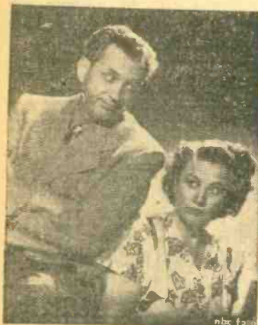
FIBBER McGEE & MOLLY are the folks at 79 Wistful Vista who drop around every Tuesday night to entertain their NBC listeners at 6:30 p.m. (PST).