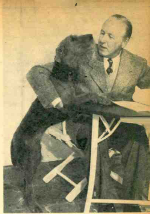
"MEG" STOPS BY for an affectionate hug from his master. The lively Airedale puppy is the producer's favorite companion during the hours he spends working in the wooded acres that surround the house.

to see before leaving the States for overseas service.