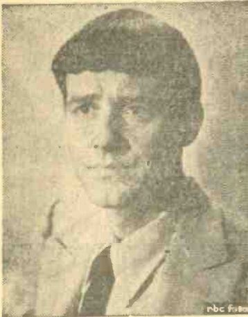
ISH KABIBBLE of Kay Kyser's "College of Musical Knowledge" looks the way he sounds on NBC.