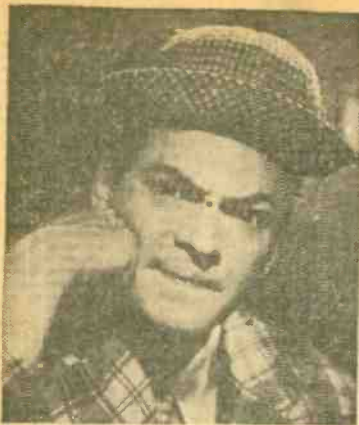
COMEDIAN Pinky Lee is the bus-boy at Villa Vallee who plagues Rudy with the wrong answers on the NBC "Rudy Vallee Show" every Thursday at 7:30 p.m. (PST).