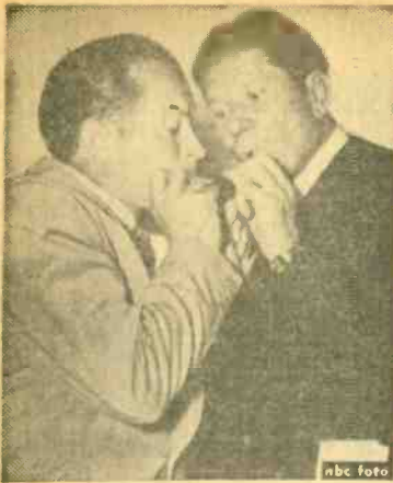
TWO BOBS! Bob Hope grabs a light from Bob Burns' pipe before going on the air at NBC in Hollywood recently.