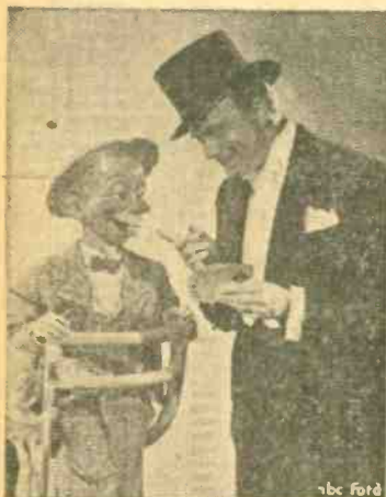
TAKE A CARD! Mortimer Snerd is one fellow Edgar Bergen can fool with card tricks. They're heard in the "Charlie McCarthy Show," Sundays at 4:00 p.m. (PST) over NBC.